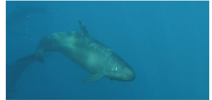
False Killer Whale orca falsa (Pseudorca crassidens)