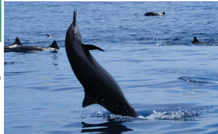
Central American Spinner Dolphin delfín tornillo ( Stenella longirostris )