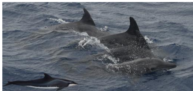
Rough-toothed Dolphin delfín de dientes rugosos ( Steno bredanensis )