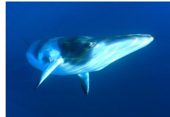
Minke Whale ballena de minke ( Balaenoptera acutorostrata )