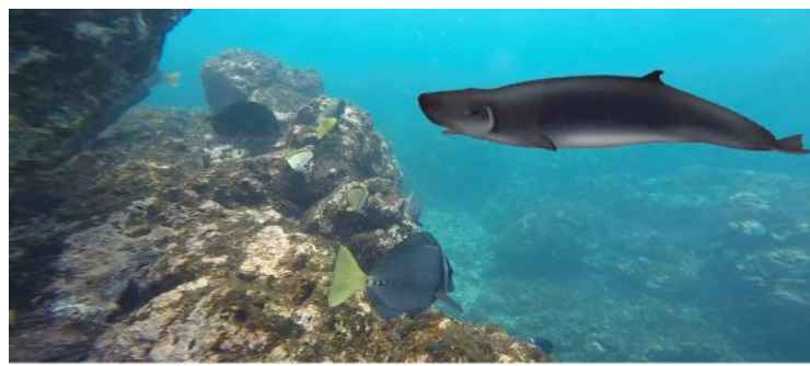
Pygmy Sperm Whale cachalote pigmeo ( Kogia breviceps )