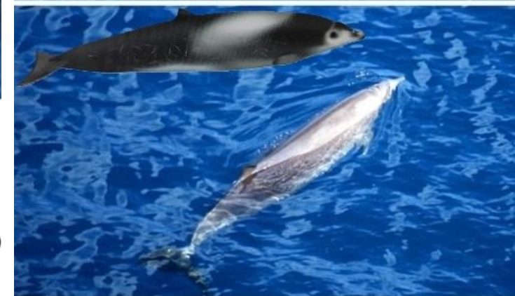
Peruvian or Pygmy Beaked Whale ballena picuda peruana ( Mesoplodon peruvianus )