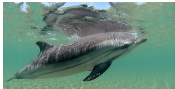
Striped Dolphin delfín rayado ( Stenella coeruleoalba )