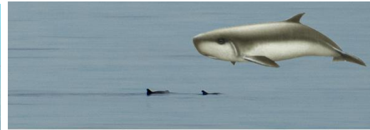
Dwarf Sperm Whale cachalote enano ( Kogia sima )