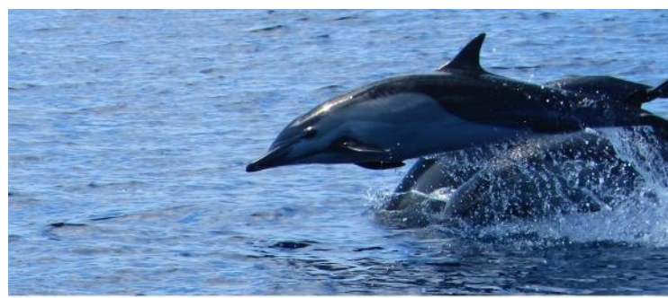
Short-beaked Common Dolphin delfín común de nuestro corto ( Delphinus delphis )