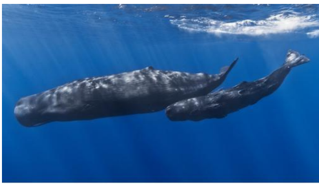
Sperm Whale cachalote ( Physeter macrocephalus )