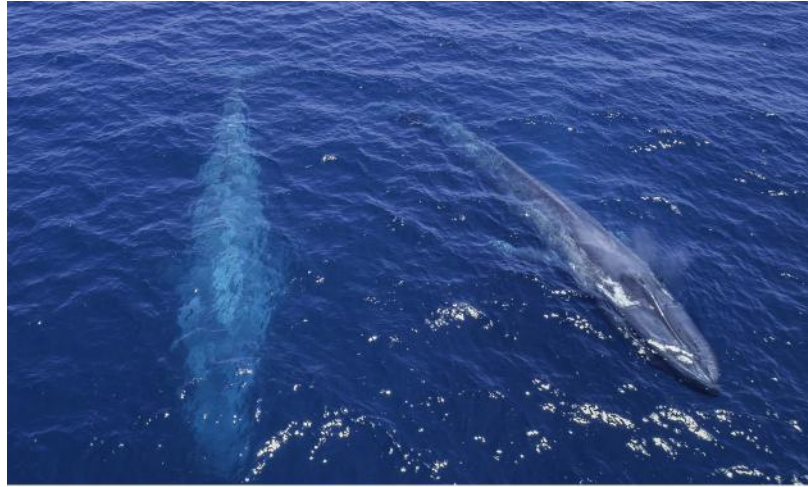
Blue Whale ballena azul ( Balaenoptera musculus )