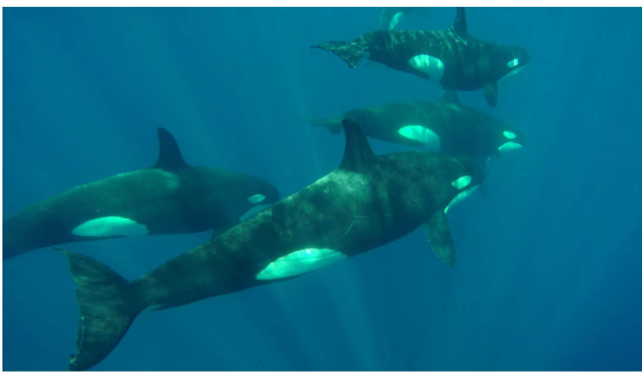
Killer Whale orca assassina (Orcinus orca)

Offshore & Transient groups are both Occasional Visitors