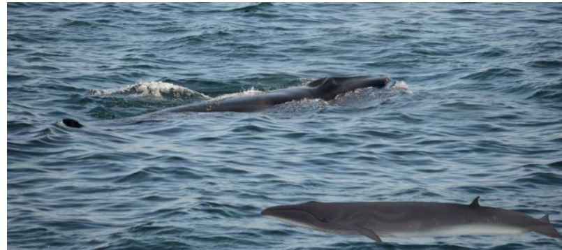
Sei Whale ballena de sei ( Balaenoptera borealis )