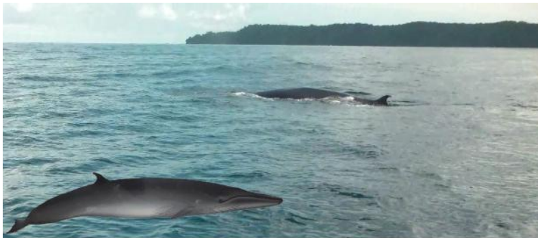
Eden's or Bryde's Whale rorcual de bryde ( Balaenoptera edeni )