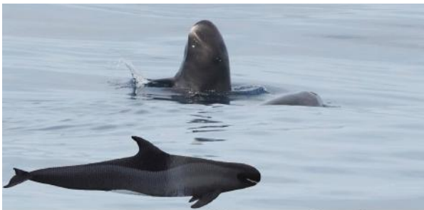
Pygmy Killer Whale orca pigmea (Feresa attenuata)