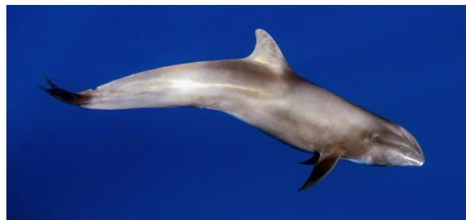
Melon-headed Whale ballena cabeza de melón (Peponocephala electra)