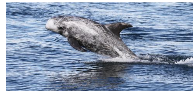
Risso's Dolphin delfín de risso (Grampus griseus)