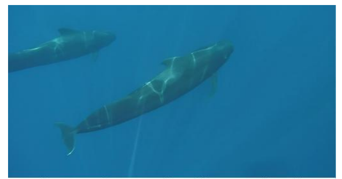
Short-finned Pilot Whale calderón o ballena piloto (Globicephala macrorhynchus)