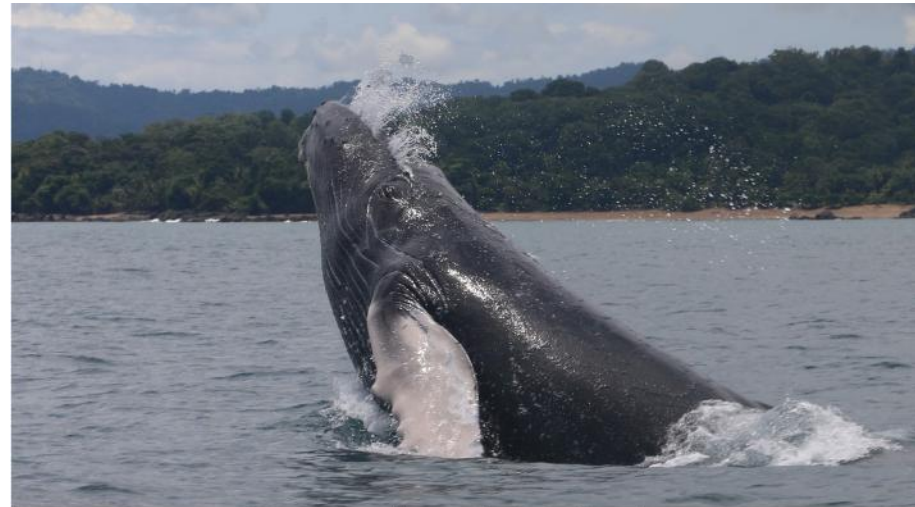
Humpback Whale ballena jorobada ( Megaptera novaeangliae )

Northern Group Dec to May (pop. 300) Southern Group July to Dec (+2,000)