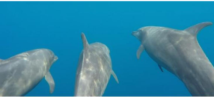
Bottlenose Dolphin delfín nariz de botella ( Tursiops truncatus )