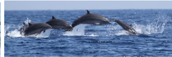
Fraser's Dolphin delfín de fraser ( Lagenodelphis hosei )