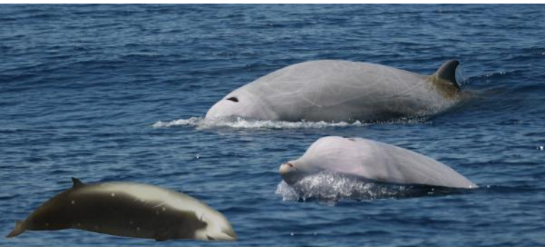
Cuvier's Beaked Whale ballena picuda de cuvier ( Ziphius cavirostris )