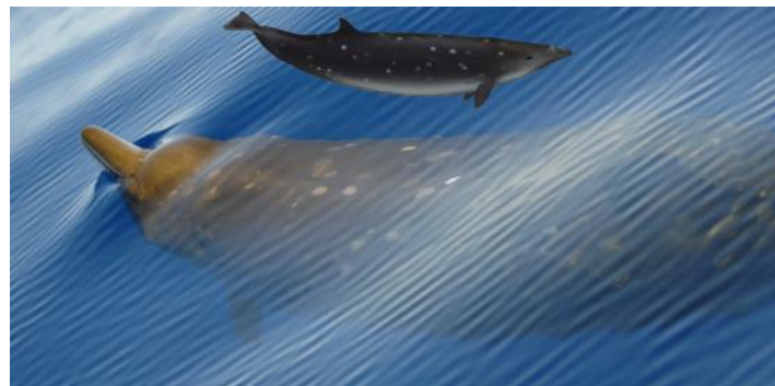
Blainville's Beaked Whale ballena-picuda de blainville ( Mesoplodon densirostris )