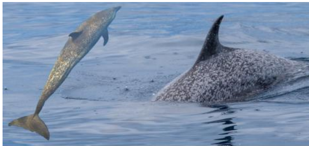
Pantropical Spotted Dolphin delfín pintado del pacifico ( Stenella attenuata )